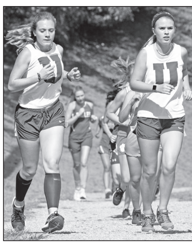
Cross Country begins Thursday at Meeks Park.

of this week's practices. "The (depth chart) is about 95% set so we're preparing for Friday night," he said. "Our kids are excited and ready to play after all the adversity they've dealt with.'